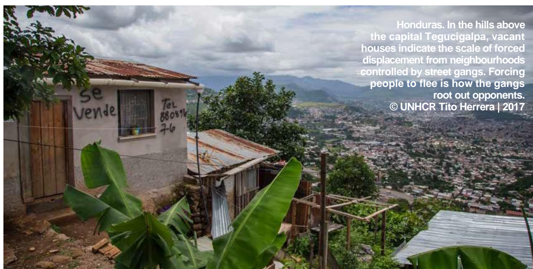
Honduras. In the hills above the capital Tegucigalpa, vacant houses indicate the scale of forced displacement from neighbourhoods controlled by street gangs. Forcing people to flee is how the gangs root out opponents.

These preparedness measures, which were funded using existing resources, provide critical baseline information and procedures for the next phase of the registration system in addressing internal displacement. In particular, the pending law on internal displacement will need to clarify restitution procedures so that IDPs can begin filing property claims.