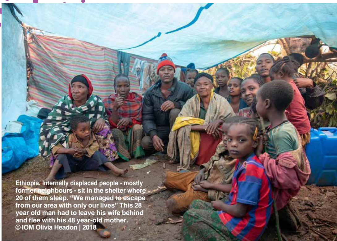
Ethiopia. Internally displaced people - mostly former neighbours - sit in the shelter where 20 of them sleep. "We managed to escape from our area with only our lives" This 28 year old man had to leave his wife behind and flee with his 48 year-old mother. © IOM Olivia Heaton | 2018

Going forward, the DSI will test the operational realities of working toward collective outcomes on durable solutions, in line with the New Way of Working, in order to avoid protracted displacement. It will do this by identifying regions with relative stability where it is possible to design area-based responses across development, peacebuilding and humanitarian responses, building on the life-saving humanitarian response.